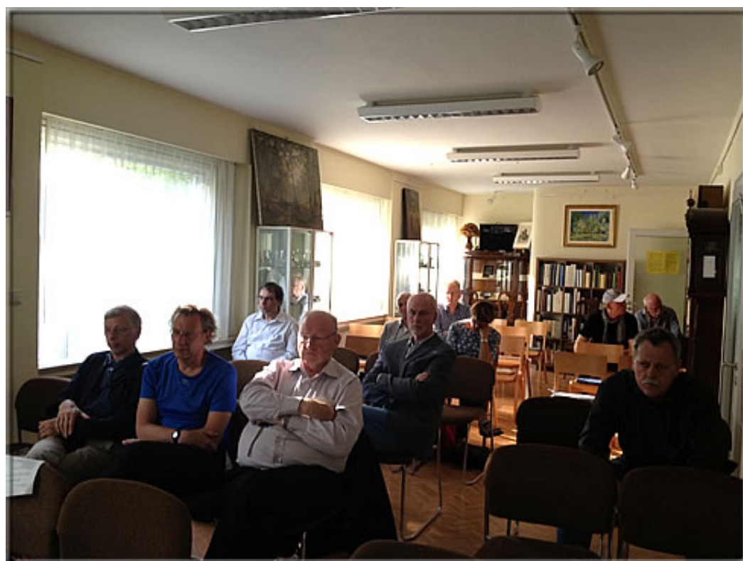
Nothing but well-