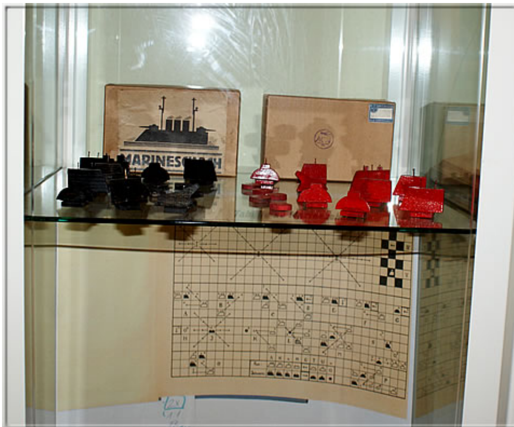
Marine chess set with wooden pieces (1943).