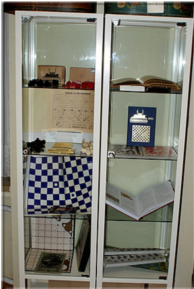
Exhibits in the glass cabinet