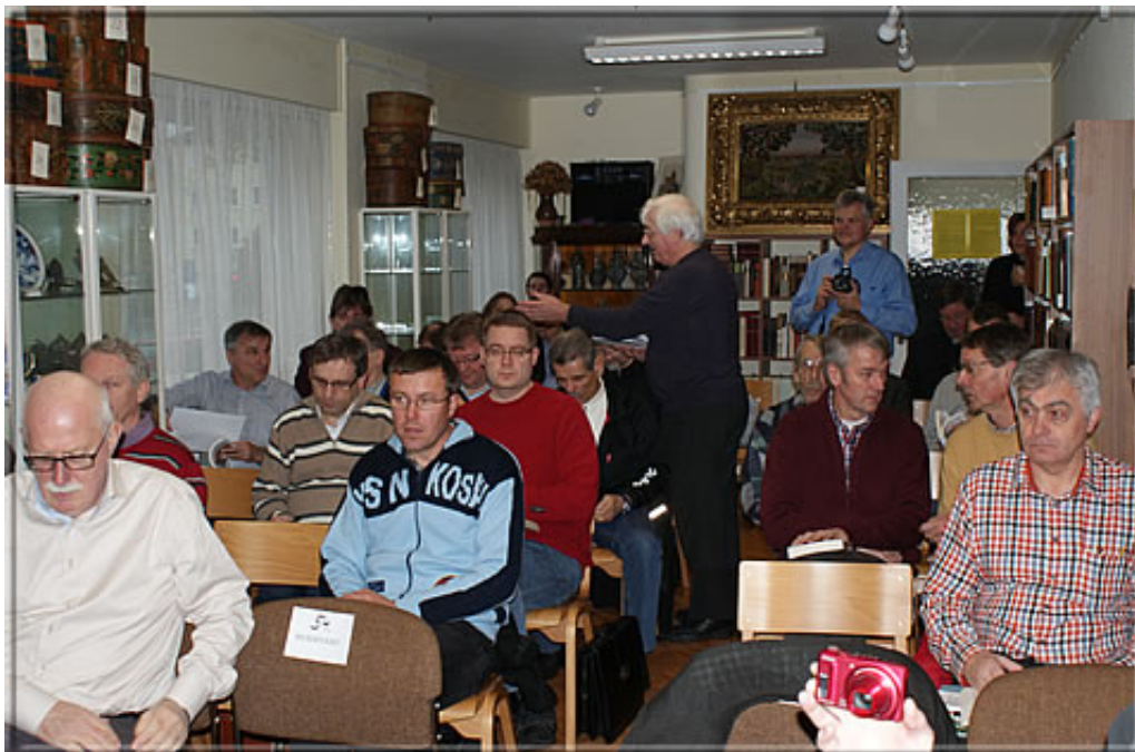
Still before the start of the auction