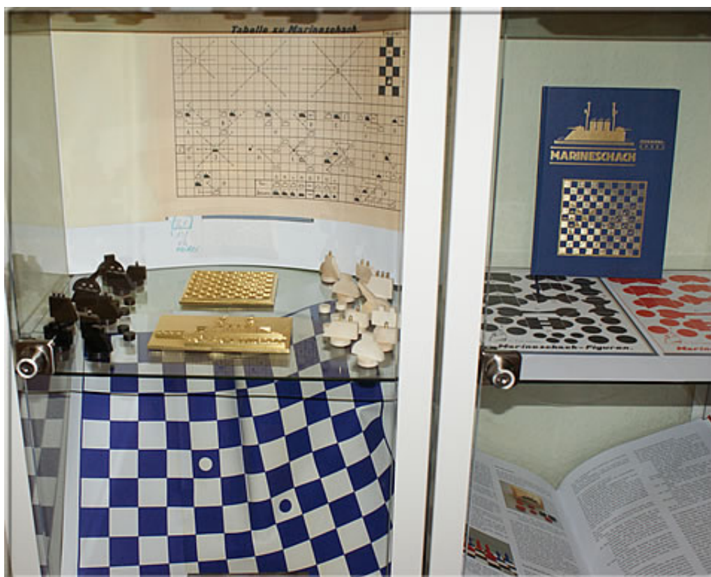
On the left a table on Marineschach, ebony and ivory pieces, and the plates for the golden cover printing of the Marineschach reprint on the right. Down to the right a Dutch book with an entry on Marineschach.