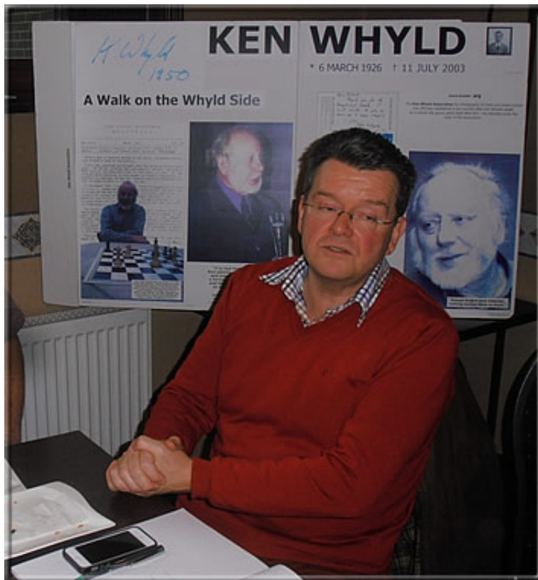
Our chairman in front of the poster of our eponym.

Below some more photos of the meeting in the conference room of the Lord Helmchen restaurant: