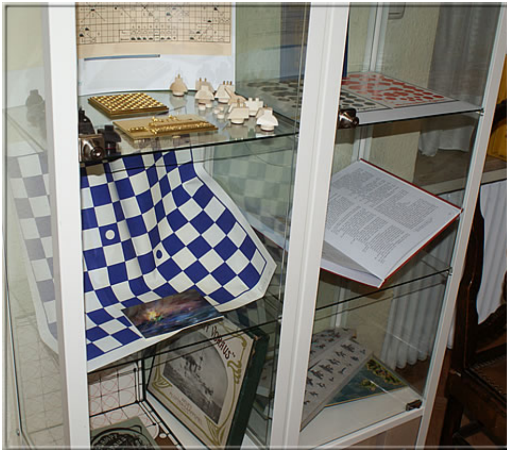
Down to the left a precursor of Marineschach: "Volldampf Voraus - Neues Flotten-Kampfspiel"