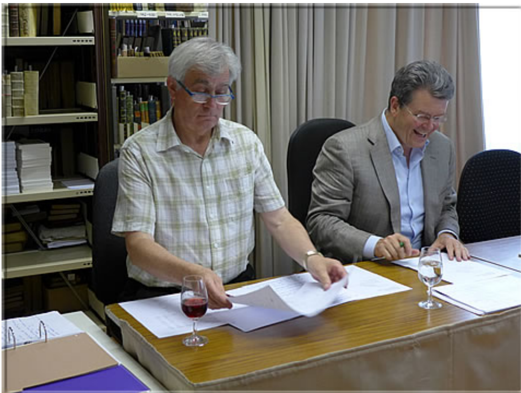
Guy was good-humored

'Teaser' memberships: Only 4 out of 20 (i.e. 20%) have decided to join our group. In my view not overwhelming.