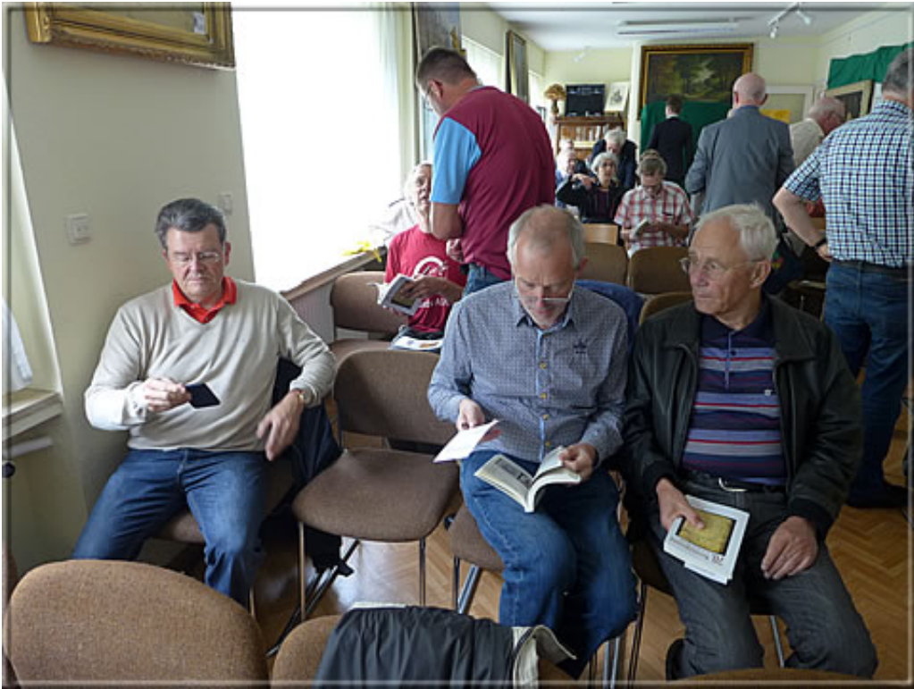
Waiting for the