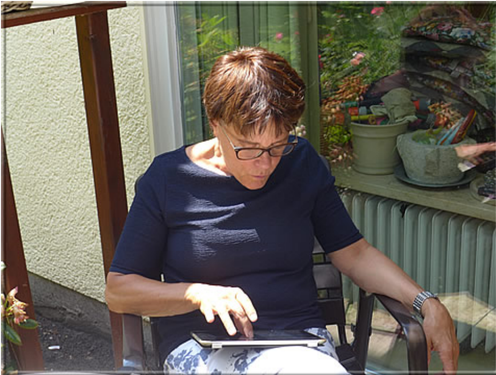
... and his wife