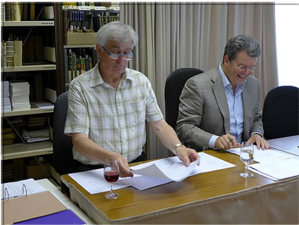
Guy was good-humored

'Teaser' memberships: Only 4 out of 20 (i.e. 20%) have decided to join our group. In my view not overwhelming.