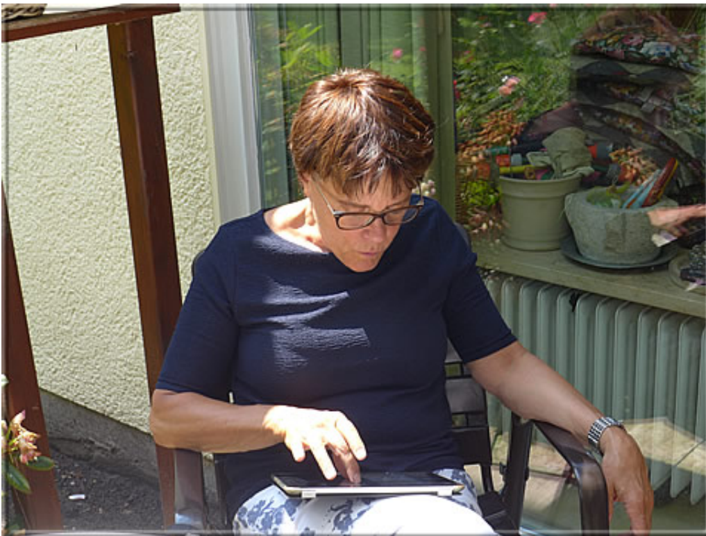
... and his wife