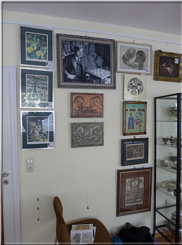
Chess graphics, paintings ... with the