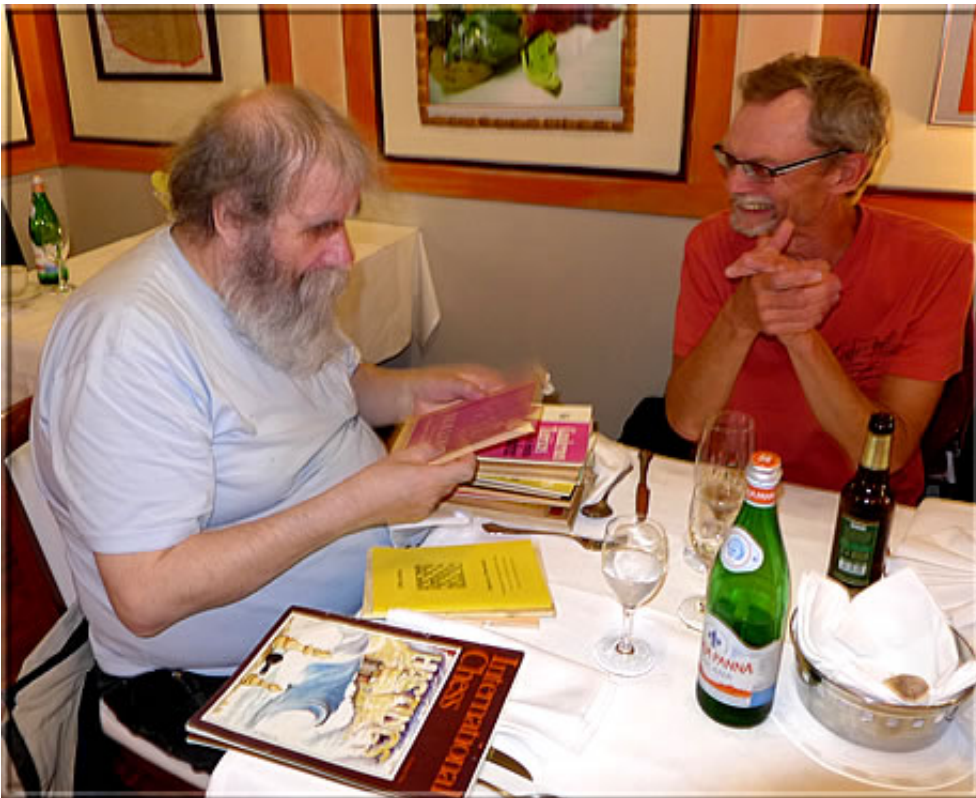
The Danish corner: