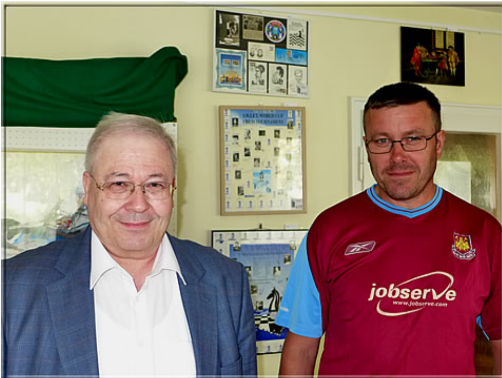
Yours truly with