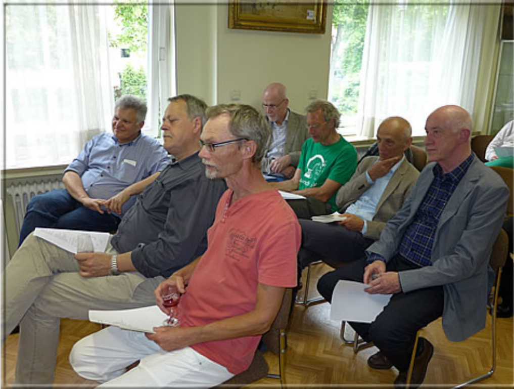
A part of the audience – all well-known faces.