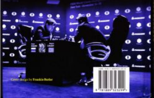
Carlsen vs. Karjakin - back cover